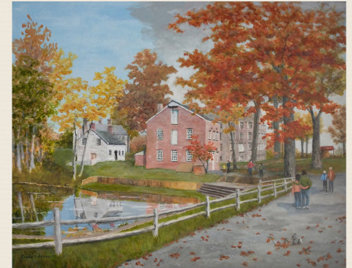
Autumn in the Historic Village at Allaire